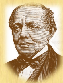
William Whipper 1804-1876

Holy Trinity Lutheran Church, Lancaster, PA. From the church website, accessed May, 2016