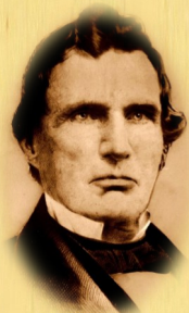
Thaddeus Stevens 1792-1868